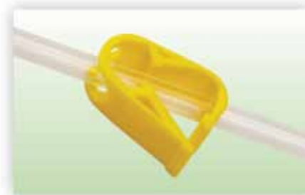
Color-coded for easy identification